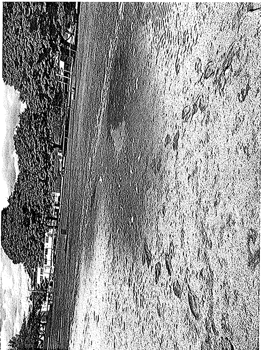
Bruce Field at Devir Park same as Kirstead 2 days after a rainstorm doesn't drain