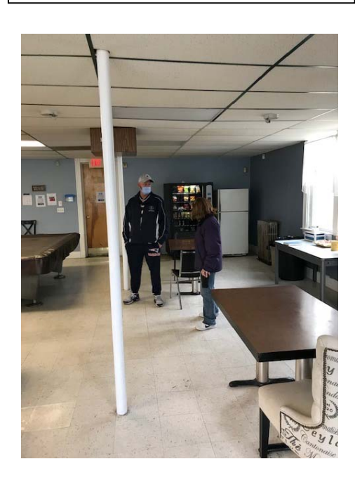
Furniture may be moved to open up area needed for set up of polling booths.