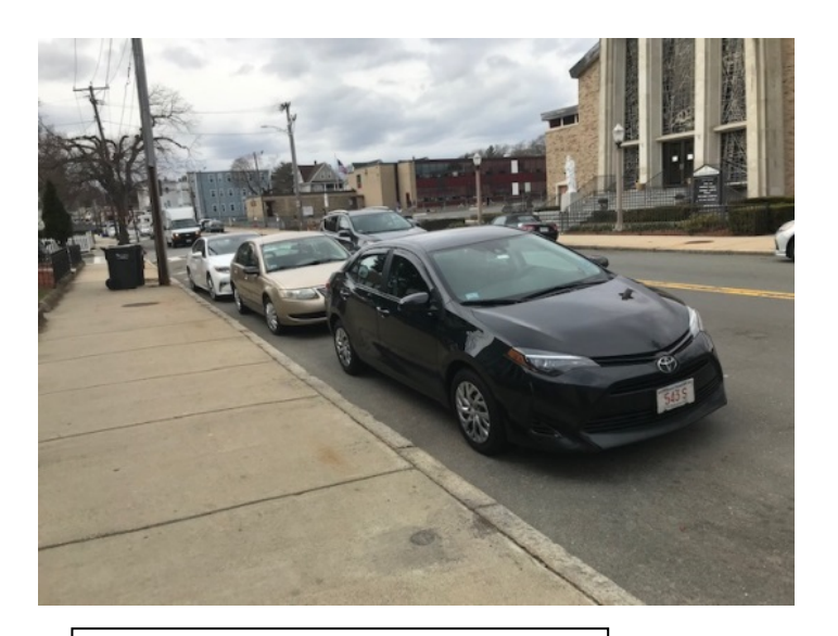
Difficult to see from this angle but there is a crosswalk and wheelchair curb cut steps from the front door.