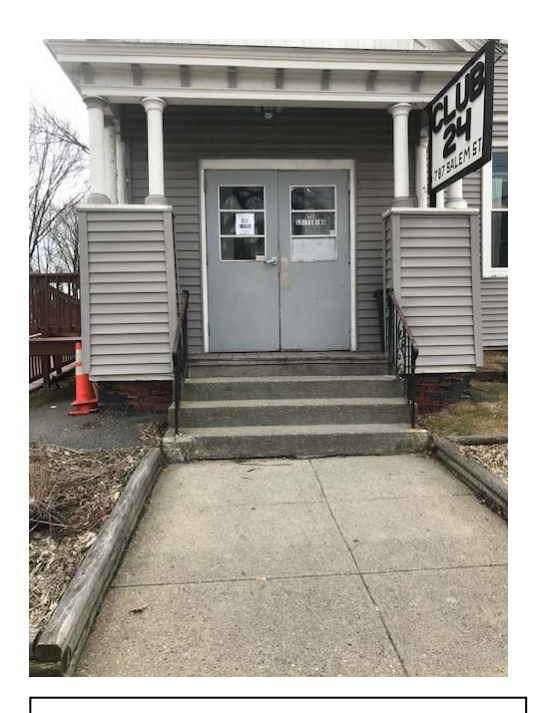
View from front of the building. Four steps into the building for walkers and a wheelchair ramp to the left for those who may need other accommodation.