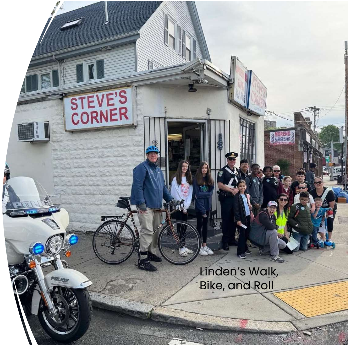
Linden's Walk, Bike, and Roll